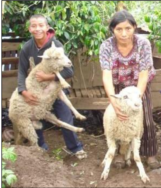
The raising of sheep is an exciting new project for the community.

will have ready access to meat and wool from their own flocks of sheep.