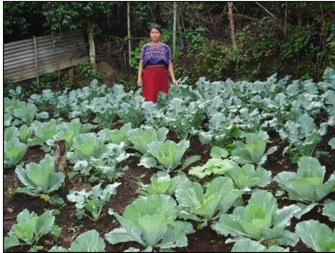
Family gardens are a source of income as well as nutrition.

The ten family gardens in the community flourished this quarter with a variety of vegetables, including cabbage, broccoli and cauliflower. These gardens are proving to be a great asset to the community's overall health, as well as a source of income for the individual growers, who sell their surplus in nearby markets.