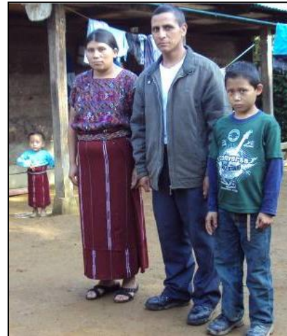
Two families completed their land payments and are now proud land owners.

Profits from the recent coffee harvest have enabled two more families in Xeucahvitz to completely pay off their land loans. Their accomplishment is a great motivation to the other families to complete their payments and achieve their own dream of being land owners.