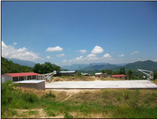
The community is especially proud of its new facility for sporting and civic events.

This quarter, the 2010-2011 school year was concluded for the community's 24 primary and 18 pre-school children. With the end of this year, six boys and girls successfully completed their primary education. Agros contributes learning materials and supplies to the school to help ensure the children receive the best possible education.