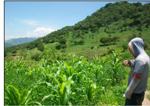
The new crops of beans and corn are growing well. The rain has been timely and sufficient for a good yield.

The Agros team is providing guidance to the families to help them obtain the best possible yields. Also, the families have obtained support from the government and other sources to purchase the needed fertilizers and other agro-chemicals for their crops.