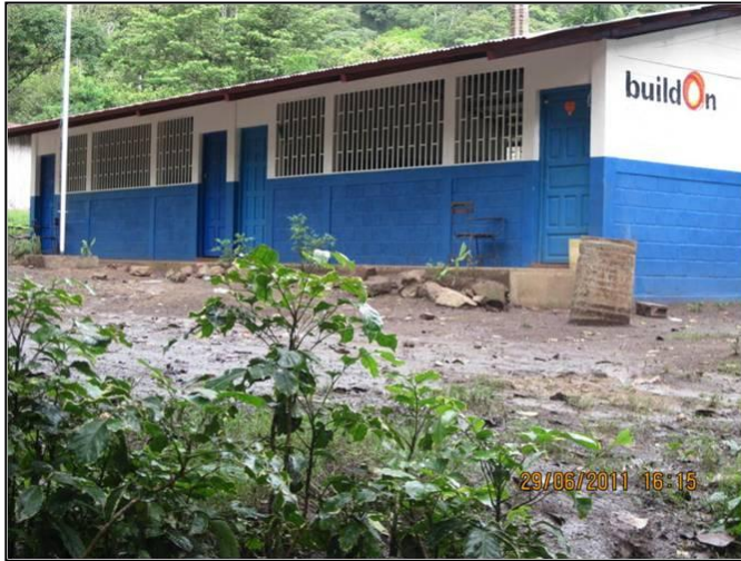
The children are thrilled with their new school.