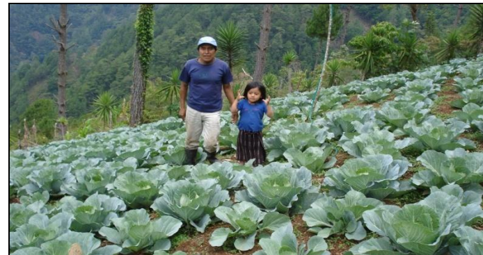
Proud growers of a beautiful cabbage crop!

Several members of the primary leadership committee were provided awareness education and training in conservation of the environment and natural resources. Their eyes were opened for the first time to the dangers faced by the environment and the importance of taking practical steps to protect it.