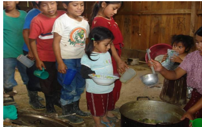
Children enjoy a hearty soup made from vegetables grown in the garden at their school.

According to Agros staff, the community has been tireless in bringing this project to completion, and their effort is “admirable.”