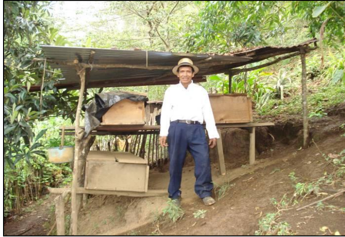
This farmer is producing organic "lombricompost," an alternative to commercial fertilizers.

Thirty families are also saving money through their gardens, in which they grow a variety of vegetables, including cauliflower, broccoli, cabbage and onions. They are able to provide a varied, nutritious diet for themselves without having to purchase produce from the local markets. And they are able to sell any surpluses they have.